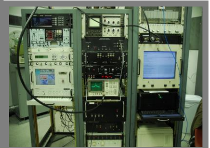
21 M Antenna Operations Center Customized Uplink/Downlink Systems