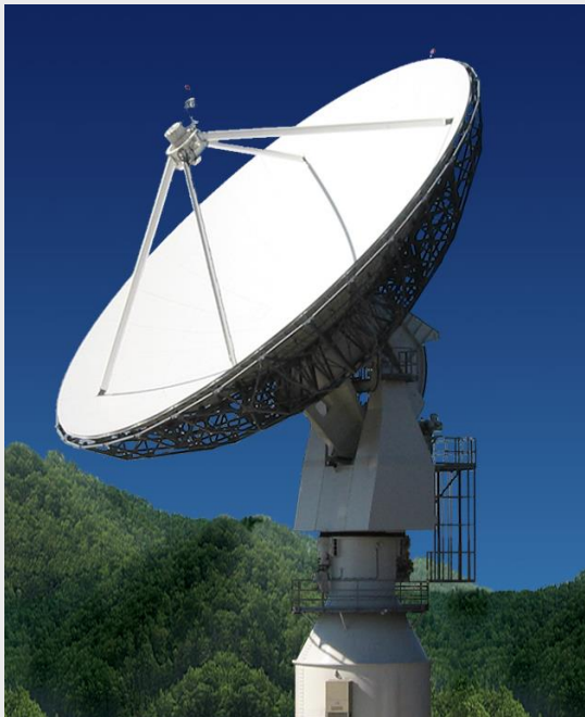
Morehead State University Space Science Center 21 Meter Space Tracking Antenna (Latitude: 38° 11 30.773 N, Longitude: 83° 26 19.948 W) U.S.A