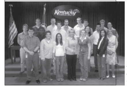
The 2006 Interns with First Lady Glenna Fletcher

Students will spend four months working with Legislative Research Commission staff and members of the General Assembly. They will be trained and treated like actual employees of the LRC.