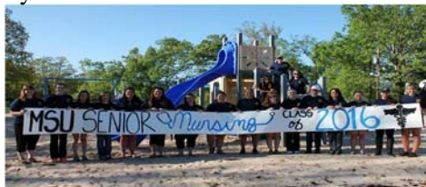
MSU BSN Class of 2016 Providing Community Service at Trooper Island

private schools, presented their research, participated in community service in conjunction with Camp Smile, Kentucky State Police Trooper Island, "Oh Baby it's a Baby Shower" sponsored in conjunction with UK Healthcare, AHEC, and St. Claire Regional Medical Center, March of Dimes Walk, and assisted in the continued relief efforts in Haiti in conjunction with Children's Lifeline International. We are so proud of our graduates, current students and faculty.